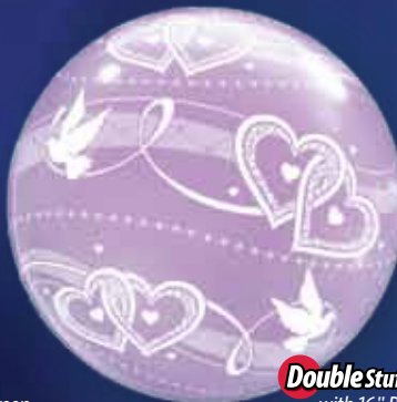
Deco Bubble – Joined Hearts All Around KAK #21364 20"