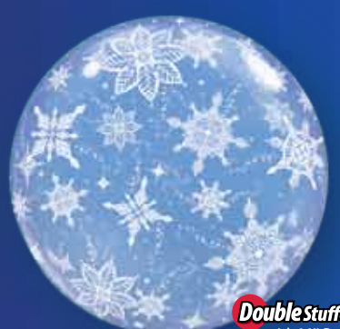
Deco Bubble – Snowflakes All Around KAK #15609 20"