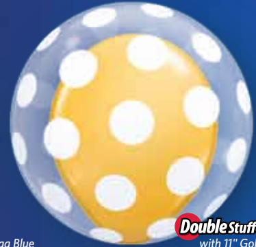
Deco Bubble – Big Polka Dots All Around KAK #16872 20"