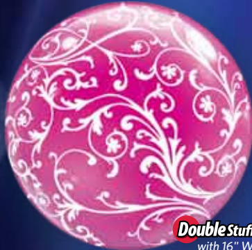
Deco Bubble – Scroll Filigree All Around KAK #23593 20"