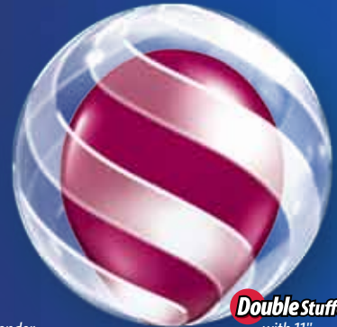
Deco Bubble – Swirls All Around KAK #15574 20"