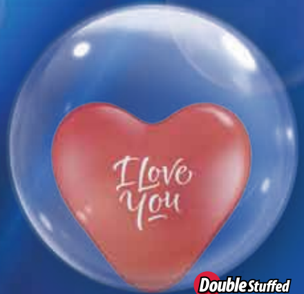
Double Stuffed with 15" "I Love You Script Modern" Ruby Red Heart