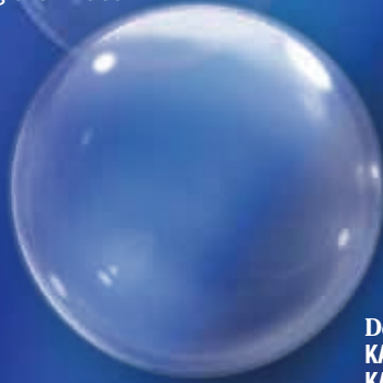
Deco Bubble KAI #68824 20" Clear KAJ #68825 24" Clear