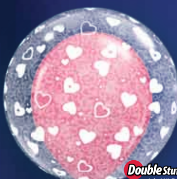
Deco Bubble – Hearts All Around KAK #15610 20"