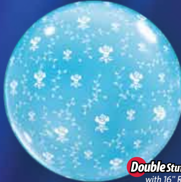
Deco Bubble – Flowers All Around KAK #12112 20"