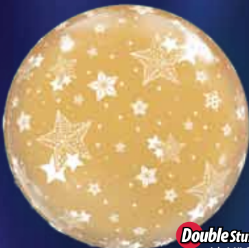
Deco Bubble – Stars All Around KAK #15611 20"