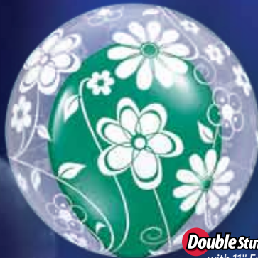
Deco Bubble – Floral Patterns All Around KAK #16874 20"